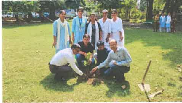
Environment Day celebration at Sri Krishna Dutt Academy